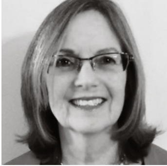
Insights From The Experts: CEO, Smooth Sale @smoothsale