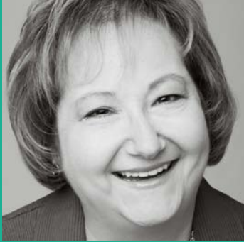
Insights From The Experts: President, Score More Sales, LLC @scoremoresales