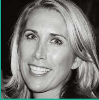
Insights From The Experts: VP of Demand Generation, DocuSign @meisenberg