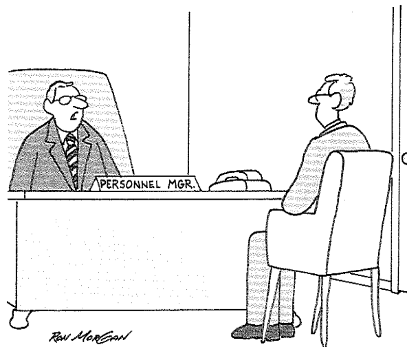
“I’m not easily impressed by hyphenated names, Mr. Sm-ith.”